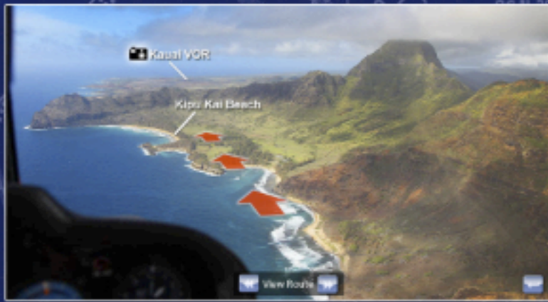
Screenshot Kauai, Route to Port Allen Airport